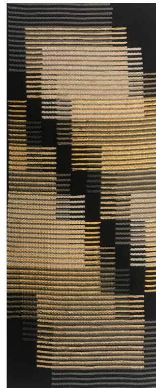
Resonance: Carlos Momentum 3 by Laura Viada

ABOUT ARCHWAY GALLERY. Artist owned and operated since 1976. Archway Gallery, one of Houston's, and the nation's, oldest artist-owned and operated galleries, is located at 2305 Dunlavy and is open Monday – Saturday from 10 a.m. – 6 p.m. and Sunday from 1 – 5 p.m. Since 1976, Archway Gallery has been exhibiting the work of the area's finest artists, providing a great selection of affordable, high quality art including sculpture, pottery, and painting in a variety of media and styles. One of the more than 30 gallery artists is always on site, providing visitors a unique opportunity to meet the artists who created the work, offering a personal insight into the process. Each month features a special exhibition highlighting a gallery artist(s). The public is invited to the monthly opening receptions that celebrate the new installations and work, usually held the first Saturday of each month from 5 – 8 p.m. In addition to monthly exhibitions, Archway also hosts a variety of demonstrations and monthly readings for local writers and authors, as well as a "Tea and Tour" program, providing visitors with a free artist-led tour of the current exhibition, followed by tea and refreshments. With 30+ artists, Archway Gallery is THE destination in the Houston area for affordable art directly from the artist. For more information, visit ArchwayGallery.com or call 713.522.2409. Like Archway Gallery on Facebook.