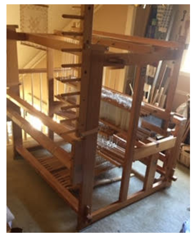
Glimakra Standard loom 59" 12 shaft countermarche Asking $3700.00

Comes with bench, 2 reeds, lease sticks, warp sticks, warping board mounted on the back of the loom, 2 raddles custom made for the loom(1" and a \frac{1}{2} " for fine threads) includes original 4 shaft counterbalance kit. I am the original owner of this well- loved loom. Ready to move to your home and weave a life with you! Located in Houston.